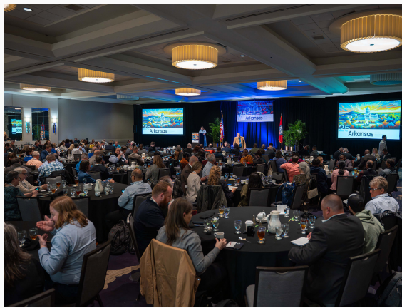
Attendees at the 2025 Arkansas Digital Government Summit

On October 28, 2025, public-sector IT leaders, technologists, agency staff, and private-sector partners gathered at the Little Rock Marriott in Little Rock for the 16th annual Arkansas Digital Government Summit, hosted by Government Technology .