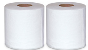
1.95 Rolls of the leading consumer bath tissue

For Reduced Maintenance Demands and the Possibility of Run-Outs