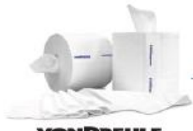
VONDREHLE #6602T Centerpull Towels

von Drehle's Soft Towel Technology provides a superior, more absorbent towel to reduce usage, and the patented dispensing cone ensures One Towel at a Time to reduce waste and lower costs.