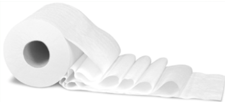
VONDREHLE #6022 - 500 Sheet 2-Ply Tissue

vonDrehle's Standard Bath Tissue Systems provide a wide variety of cost-effective, sanitary solutions that reduce maintenance demands as well as the possibility of run-outs.